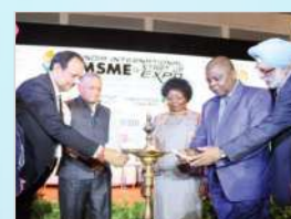
MSME Minister & Ambassador of Zimbabwe