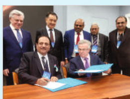
Signing MOU with Financial & Business Association of Euro-Asian Cooperation Russia