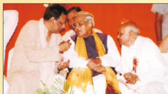
Sh. Atal Bihari Vajpayee Former Prime Minister of India