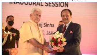
Sh. Manoj Sinha Jammu & Kashmir Lieutenant Governor