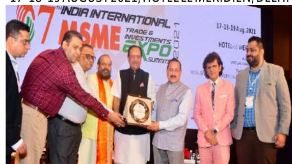
Dr. Jitender Singh Union Minister (MOS) Prime Ministers Office (PMO)