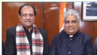
Sh. Bhupender Yadav Union Cabinet Minister for Environment, Forest & Climate Change; and Labour & Employment