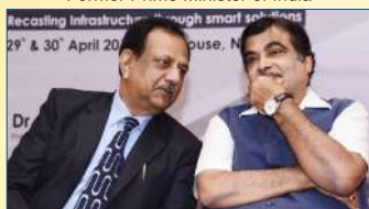
Sh. Nitin Gadkari, Union Minister of Road Transport & Highways