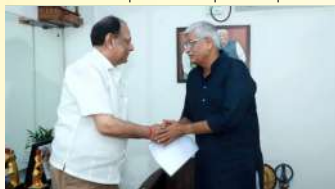
Sh. Gajendra Singh Shekhawat Minister of Culture and Tourism