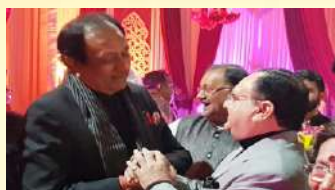
Sh. JP Naddha, President of Bhartiya Janta Party