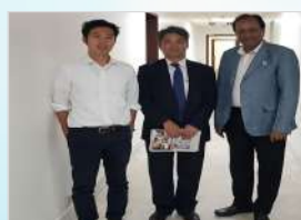
Embassy of Japan