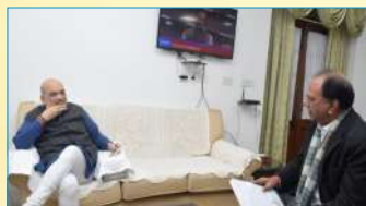
Sh. Amit Shah Union Home Minister, Minister of Cooperation and MP