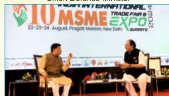
Sh. Piyush Goel, Union Minister of Commerce, Industry, Textiles & Consumer Affairs