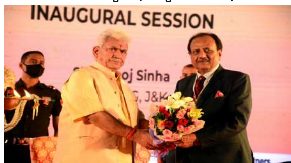
Sh. Manoj Sinha, Lieutenant Governor of Jammu & Kashmir