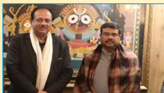
Sh. Dharmendra Pradhan, Union Minister of Education, Skill Development & Entrepreneurship