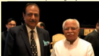
Sh. Manohar Lal Khattar Minister of Housing, Urban Affairs & Power