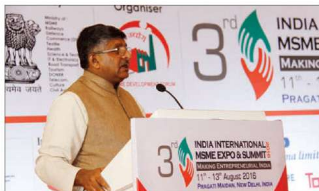
Sh. Ravi Shankar Prasad, Union Cabinet Minister for I.T., ITes, Electronics & Law, deliberating on Ease of doing business policies & new opportunities in India