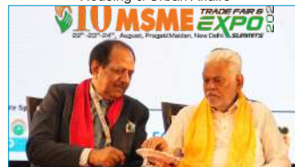
Sh. Parshottam Rupala Union Minister of Animal Husbandry, Dairying and Fisheries