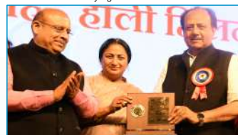
Smt. Rekha Gupta Chief Minister of Delhi