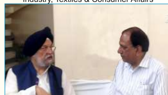
Sh. Hardeep Singh Puri Minister of Petroleum & Natural Gas, Housing & Urban Affairs