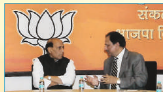
Sh. Rajnath Singh, Union Defence Minister