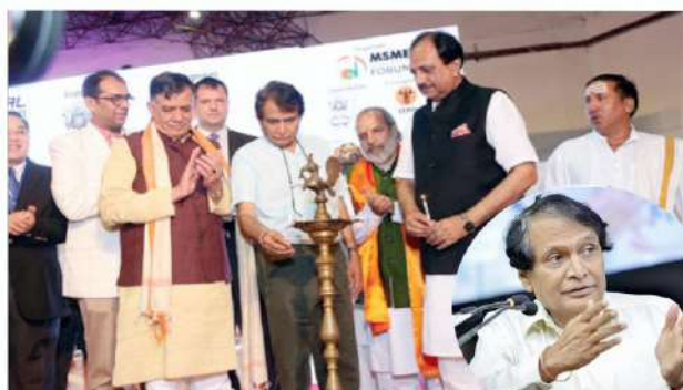
Sh. Suresh Prabhu, Union Minister of Railways, Commerce & Industry with Sh. Satish Mahana, Industry Minister, UP & Sh. Jai Bhagwan Goel Inaugurating 5th Expo