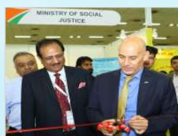
Ambassador of Israel