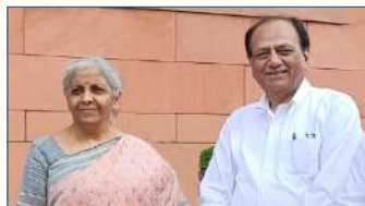
Smt. Nirmala Sitharaman, Union Finance Minister