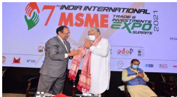
Sh. Parshottam Rupala, Minister of State for Animal Husbandry, Dairying and Fisheries