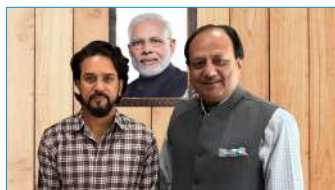
Sh. Anurag Thakur, Union Minister of I&B, Youth Affairs & Sports