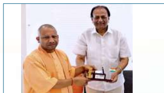
Sh. Yogi Adityanath, Chief minister of Uttar Pradesh