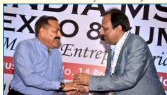
Dr. Jitender Singh Union Minister (MOS) Prime Ministers Office (PMO)