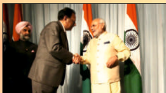
Sh. Narendra Modi Prime Minister of India