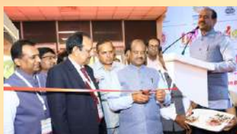
Sh. Om Birla Speaker of India Parliament