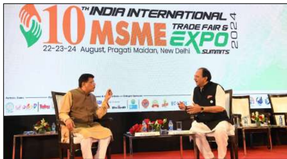
Sh. Piyush Goyal, Minister of Textiles, Consumer Affairs, Food & Public Distribution