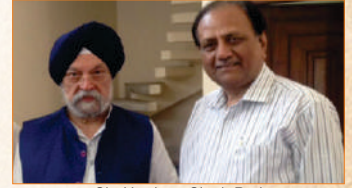
Sh. Hardeep Singh Puri Minister of Petroleum & Natural Gas, Housing & Urban Affairs