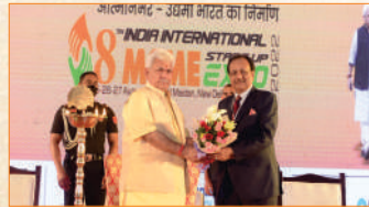
Sh. Manoj Sinha Jammu & Kashmir Lieutenant Governor