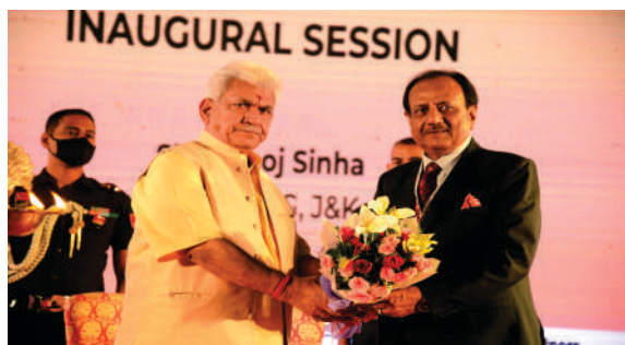
Sh. Manoj Sinha, Lieutenant Governor of Jammu & Kashmir