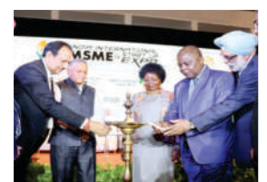
Gen. V.K. Singh MOS Civil Aviation with MSME Minister of Zimbabwe & Ambassador of Zimbabwe