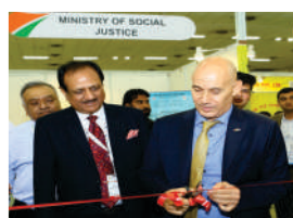
Ambassador of Israel