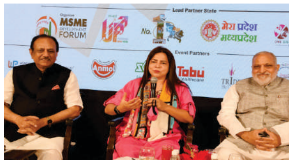
Smt. Meenakshi Lekhi, Minister of State for External Affairs and Culture