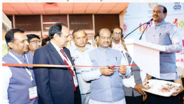
Sh. Om Birla, Speaker of Indian Parliament