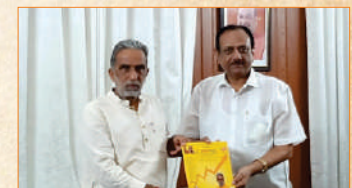
Shri Krishan Pal Gurjar, MOS-Heavy Industries & Public Enterprises & Power