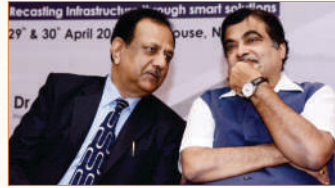
Sh. Nitin Gadkari, Union Minister of Road Transport & Highways