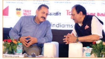
Dr. Jitender Singh Union Minister (MOS) Prime Ministers Office (PMO)