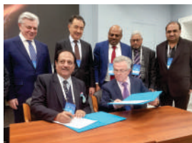
Signing MOU with Financial & Business Association of Euro-Asian Cooperation Russia