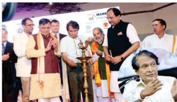
Sh. Suresh Prabhu, Union Minister of Railways, Commerce & Industry with Sh. Satish Mahana, Industry Minister, UP & Sh. Jai Bhagwan Goel Inaugurating 5th Expo