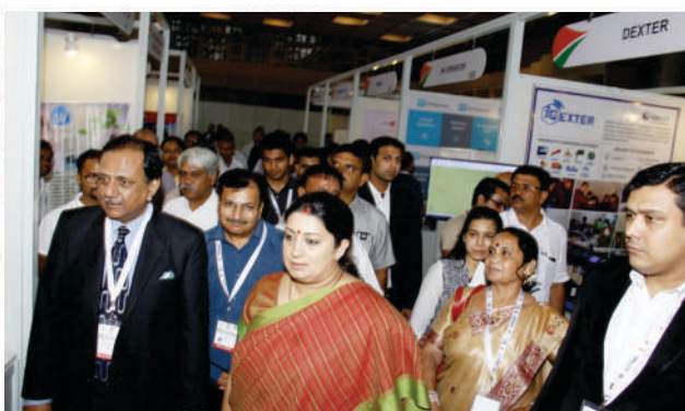
Smt. Smriti Irani Ministry of Woman & Child Development Ministry of Minority Affairs