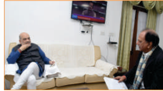
Sh. Amit Shah Union Home Minister, Minister of Cooperation and MP