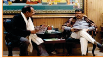
Sh. Dharmendra Pradhan, Union Minister of Education, Skill Development & Entrepreneurship