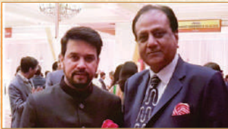
Sh. Anurag Thakur, Union Minister of I&B, Youth Affairs & Sports