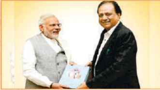
Sh. Narendra Modi Prime Minister of India