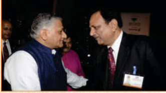
General Vijay Kumar Singh, Union Minister (MSO), Ministry of Road Transport and Highways