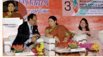
Smt. Smriti Irani, Minister of women & Child Development addressing the Expo-Summit