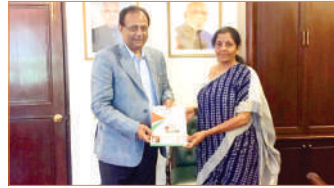
Smt. Nirmala Sitharaman, Union Finance Minister