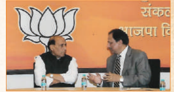
Sh. Rajnath Singh, Union Defence Minister