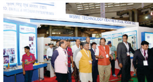
Shri Ravi Shankar Prasad, Union Electronic & IT Minister