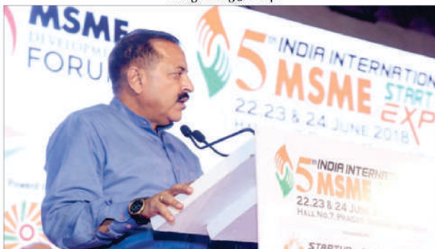
Dr. Jitender Singh, Union Minister (MSO) Prime Minister Office (PMO) & DONAR