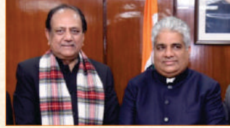
Sh. Bhupender Yadav Union Cabinet Minister for Environment, Forest & Climate Change; and Labour & Employment