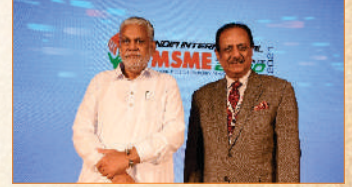
Sh. Parshottam Rupala Union Minister of Animal Husbandry, Dairying and Fisheries