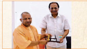
Sh. Yogi Adityanath, Chief minister of Uttar Pradesh