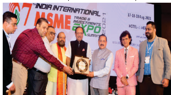
Dr. Jitender Singh Union Minister (MOS) Prime Ministers Office (PMO)