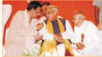
Sh. Atal Bihari Vajpayee Former Prime Minister of India