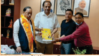
Sh. Narayan Rane, Union Minister of MSME