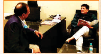
Sh. Piyush Goel, Union Minister of Commerce, Industry, Textiles & Consumer Affairs