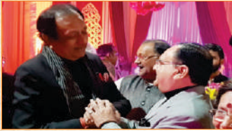
Sh. JP Naddha, President of Bhartiya Janta Party